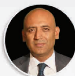
Master of Ceremonies

GM & Managing Director Sanofi - Aventis Pakistan