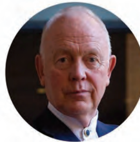
Tony Buzan , Inventor of Mind Maps