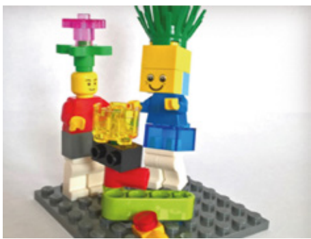
Building Individual Models (AT1)