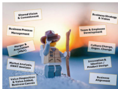
Extracting Simple Guiding Principles (AT6)

Multiple activities focusing on individual model building, shared model building, landscaping, building a system and playing emergence.