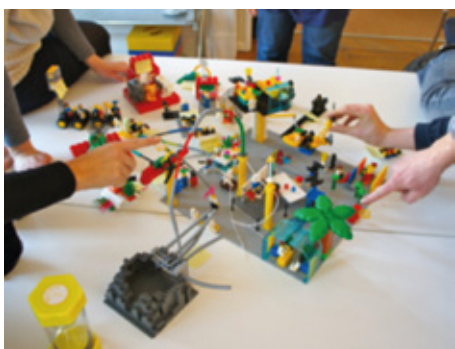
Playing Emergence & Decisions (AT5)