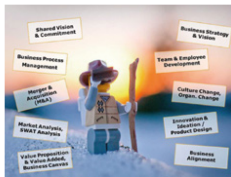
Extracting Simple Guiding Principles (AT6)

Multiple activities focusing on individual model building, shared model building, landscaping, building a system and playing emergence.