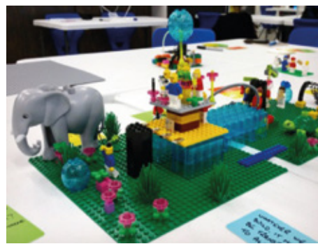
Building Shared Models (AT2)