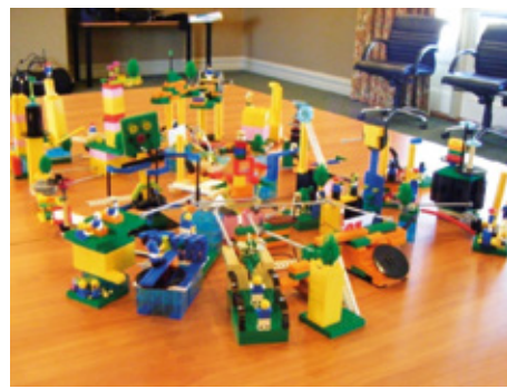
Building a System (AT4)