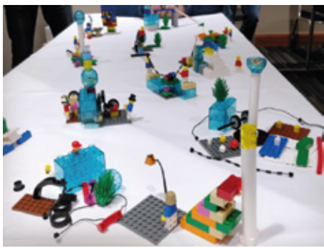
Creating a Landscape (AT3)